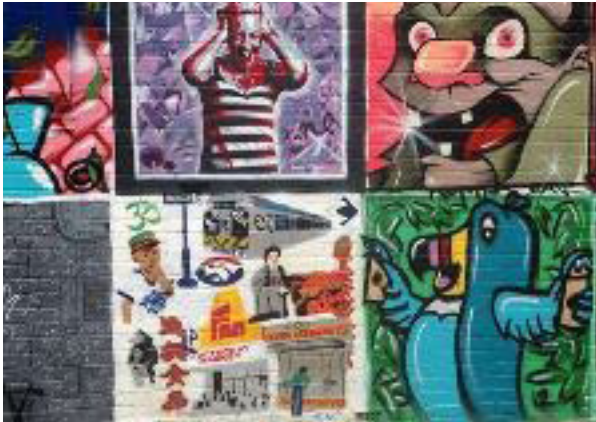
Street Art, Footscray, Melbourne, Victoria.

The Master of Applied Psychology (Community Psychology) Program is delivered at the Footscray Precinct of Victoria University, Melbourne, Australia.